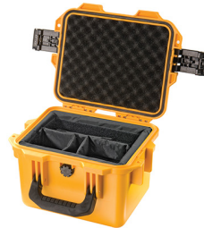
iM2075-X0002 With Padded Dividers