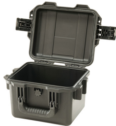
iM2075-X0000 No Foam