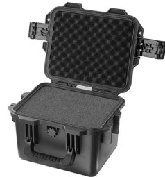
iM2075-X0001 With Foam