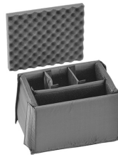
iM2075-DIV Padded Divider Set